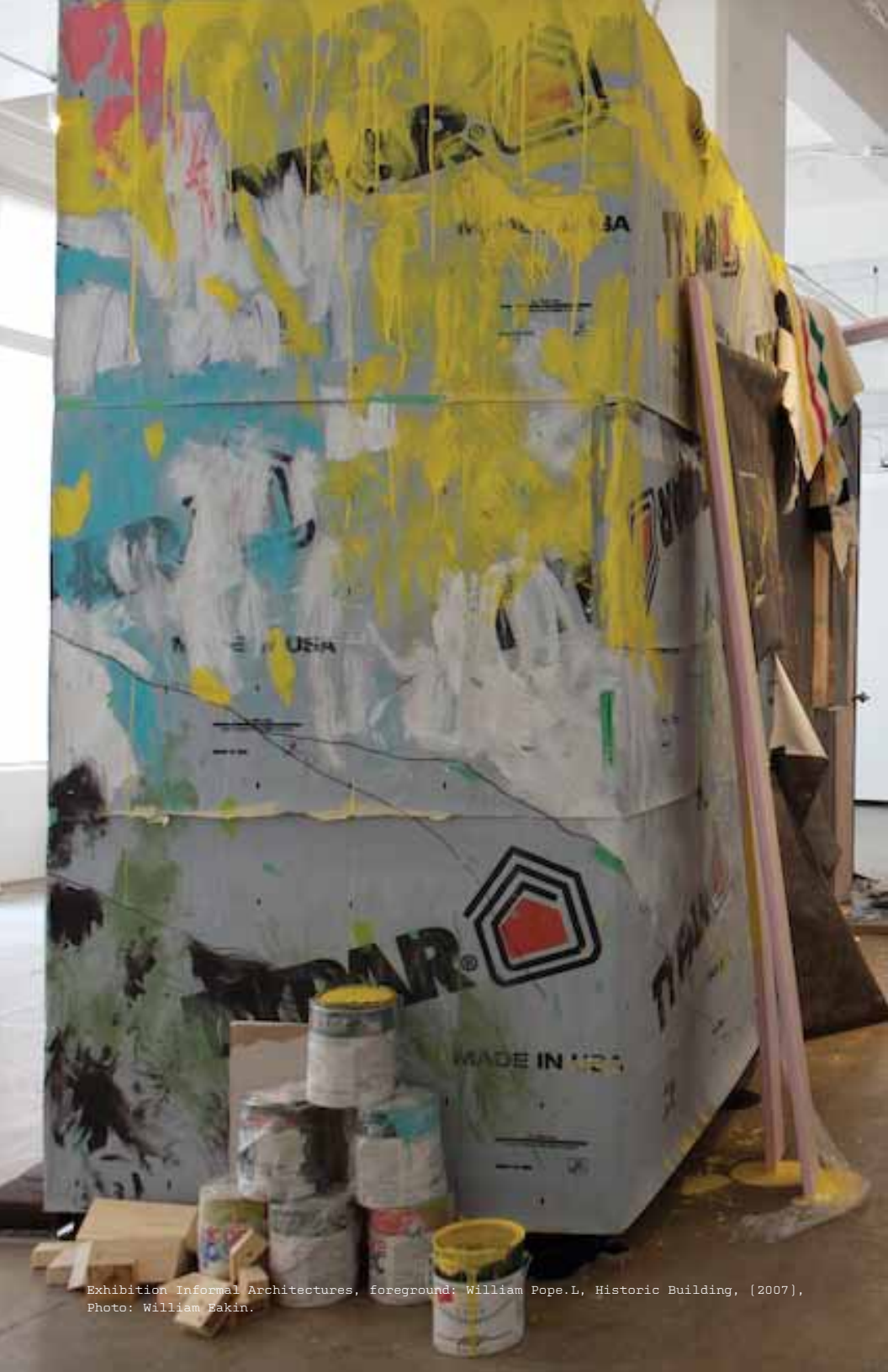
Exhibition Informal Architectures, foreground: William Pope.L, Historic Building, (2007), Photo: William Eakin.