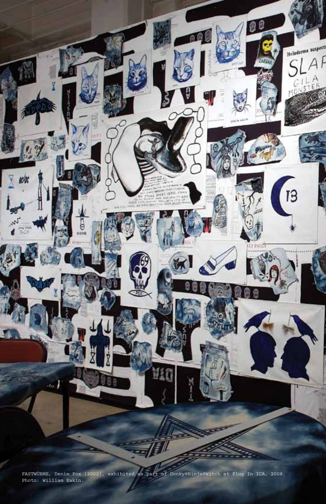
FASTWÜRMS, Denim Pox (2002), exhibited as part of Donky@Ninja@Witch at Plug In ICA, 2008.