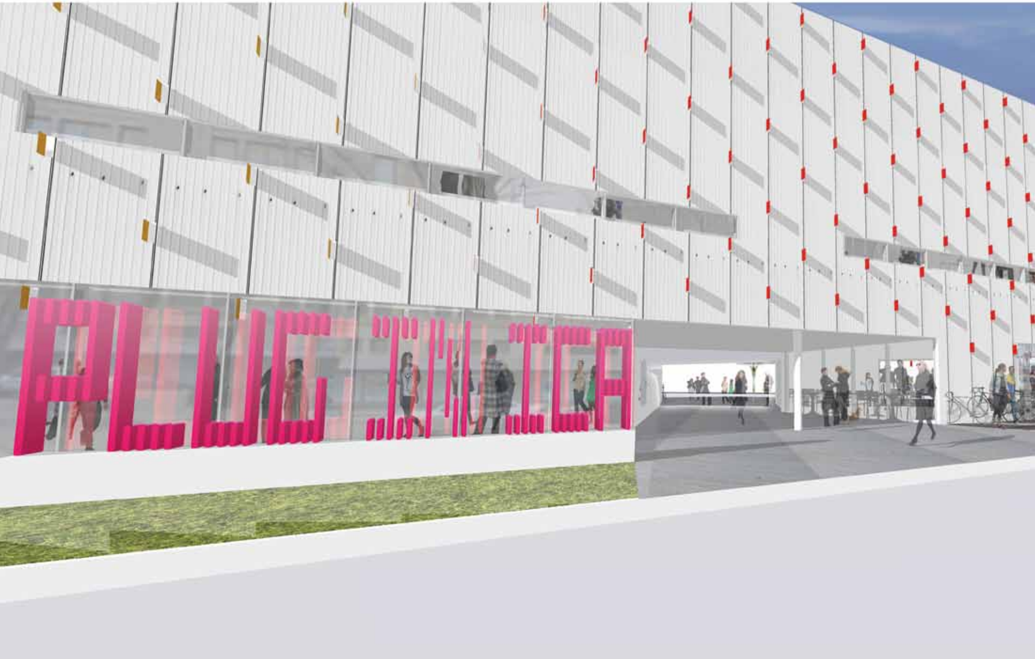
New Plug In ICA facility at 460 Portage Avenue, image courtesy DPA + PSA + DIN Collective Architects.